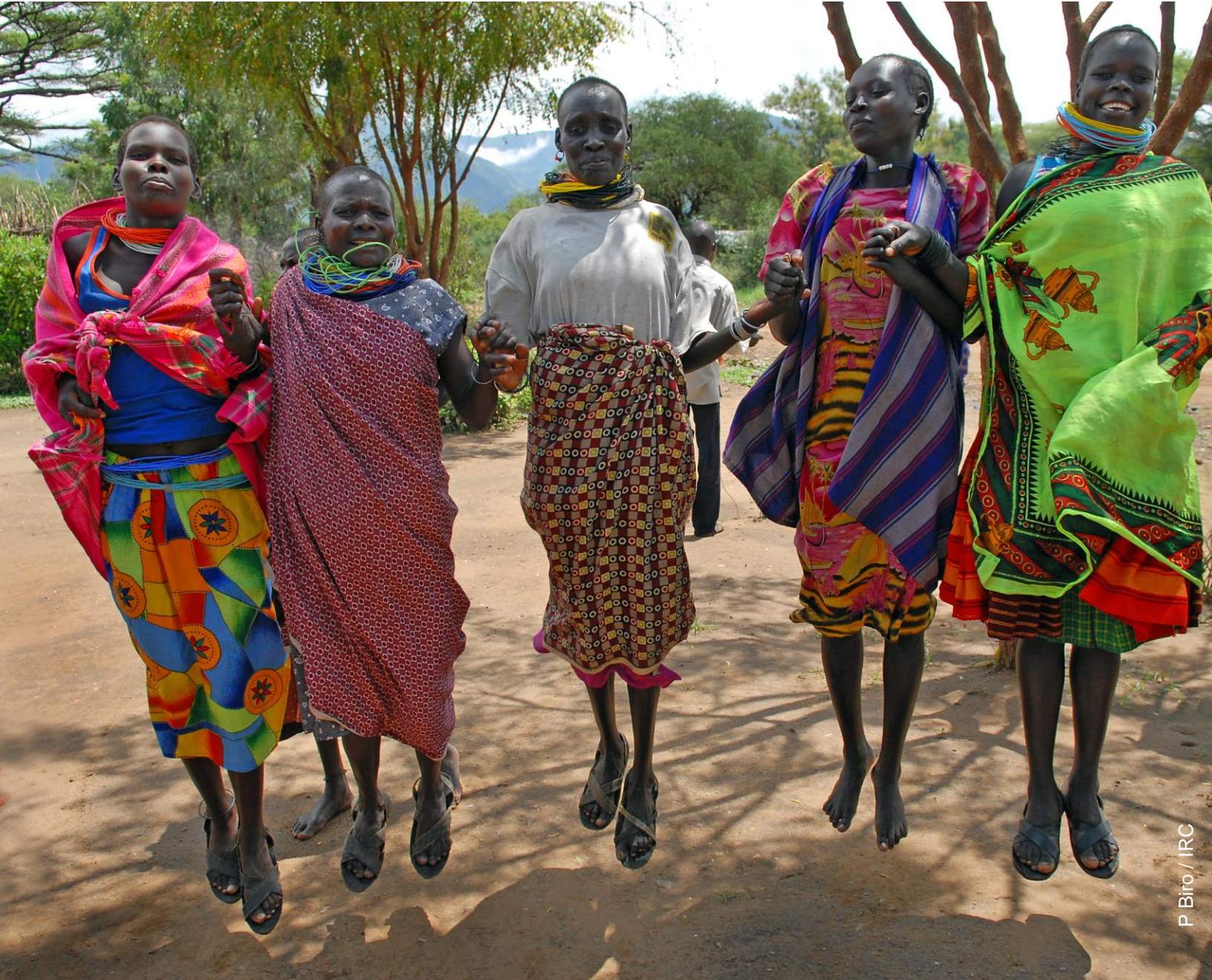
P Bitro / IRC