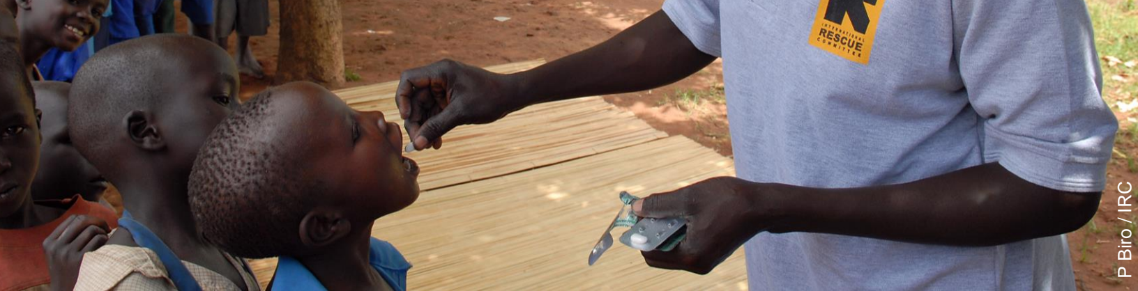
P Biro / IRC