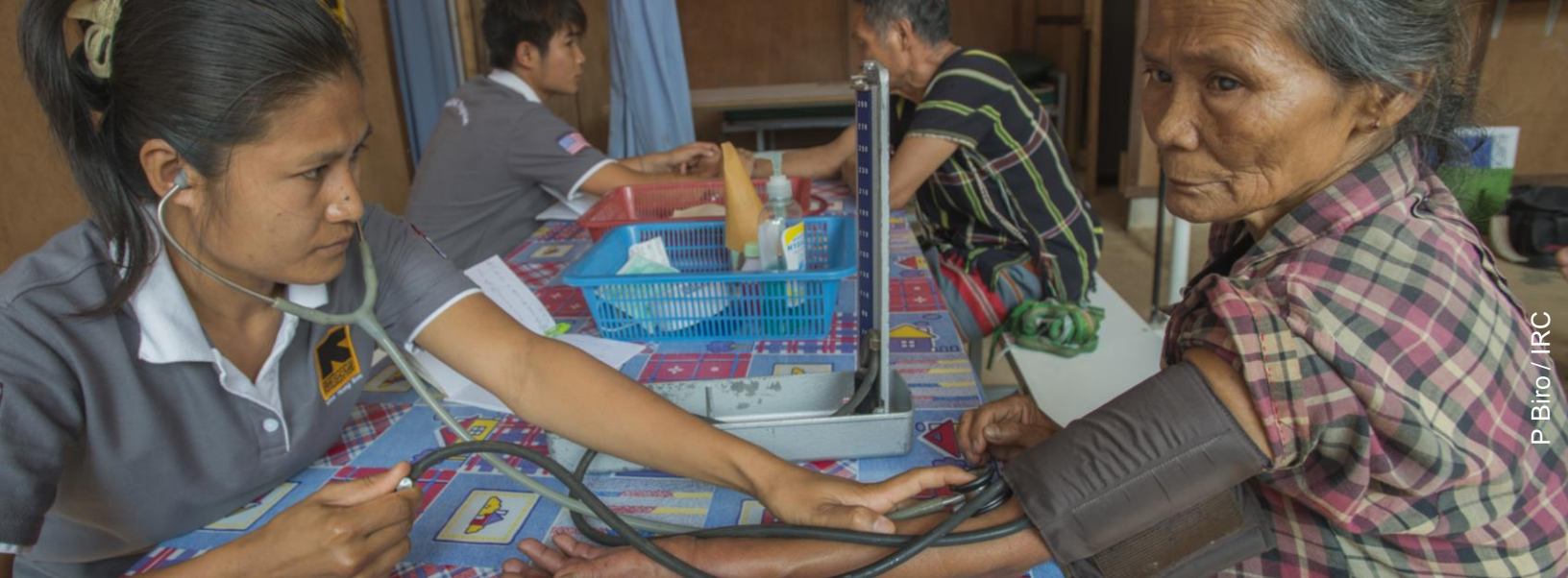
P. Biro / IRC