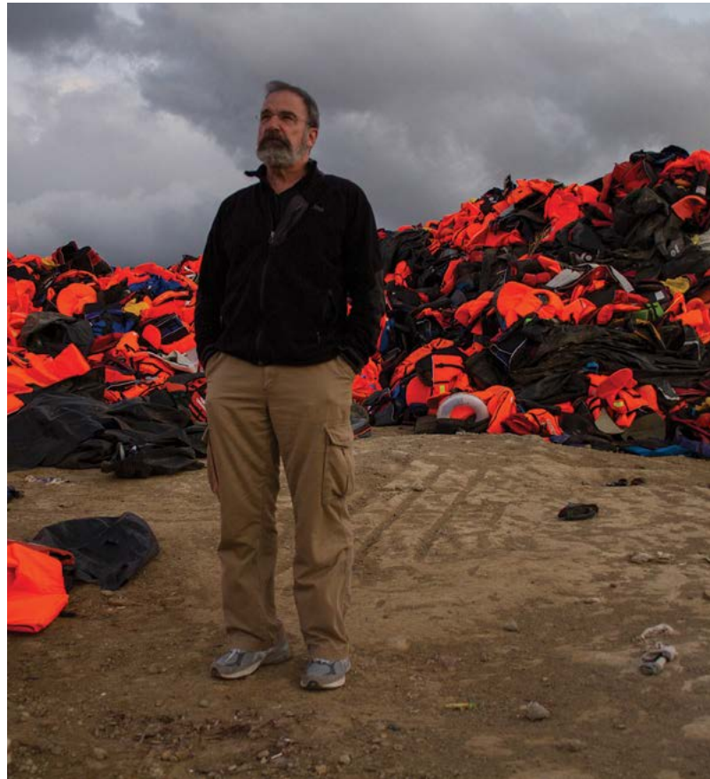
Actor Mandy Patinkin visits Lesbos to witness arrivals of refugees firsthand.

— MANDY PATINKIN , actor, with the IRC on Lesbos.