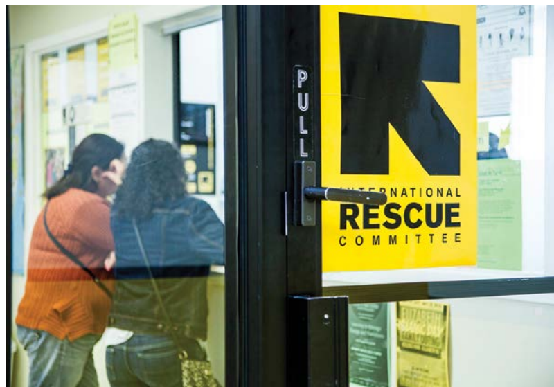
Clients check in at the IRC's resettlement office in New Jersey.

Drawing on research and hard data, we will demonstrate the success of refugee resettlement and its benefits to local communities. The IRC will also establish itself as a leading voice to counter fear-based anti-resettlement arguments and to dispel public misinformation about Syrian and other refugees.