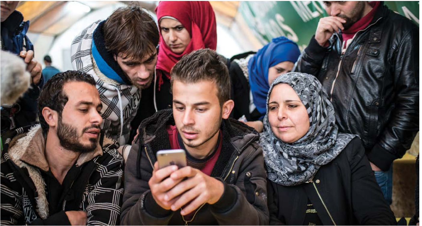
The Milas family and relatives consult RefugeeInfo.eu at an aid station in Serbia before attempting to travel on to Germany.