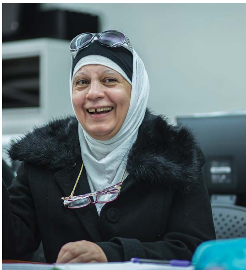
A refugee participates in an English language class at the IRC’s New York resettlement office.

“When we landed at the airport near our new home in Northern California, IRC case workers were the first welcoming faces we saw,” says Jasem, a Syrian refugee