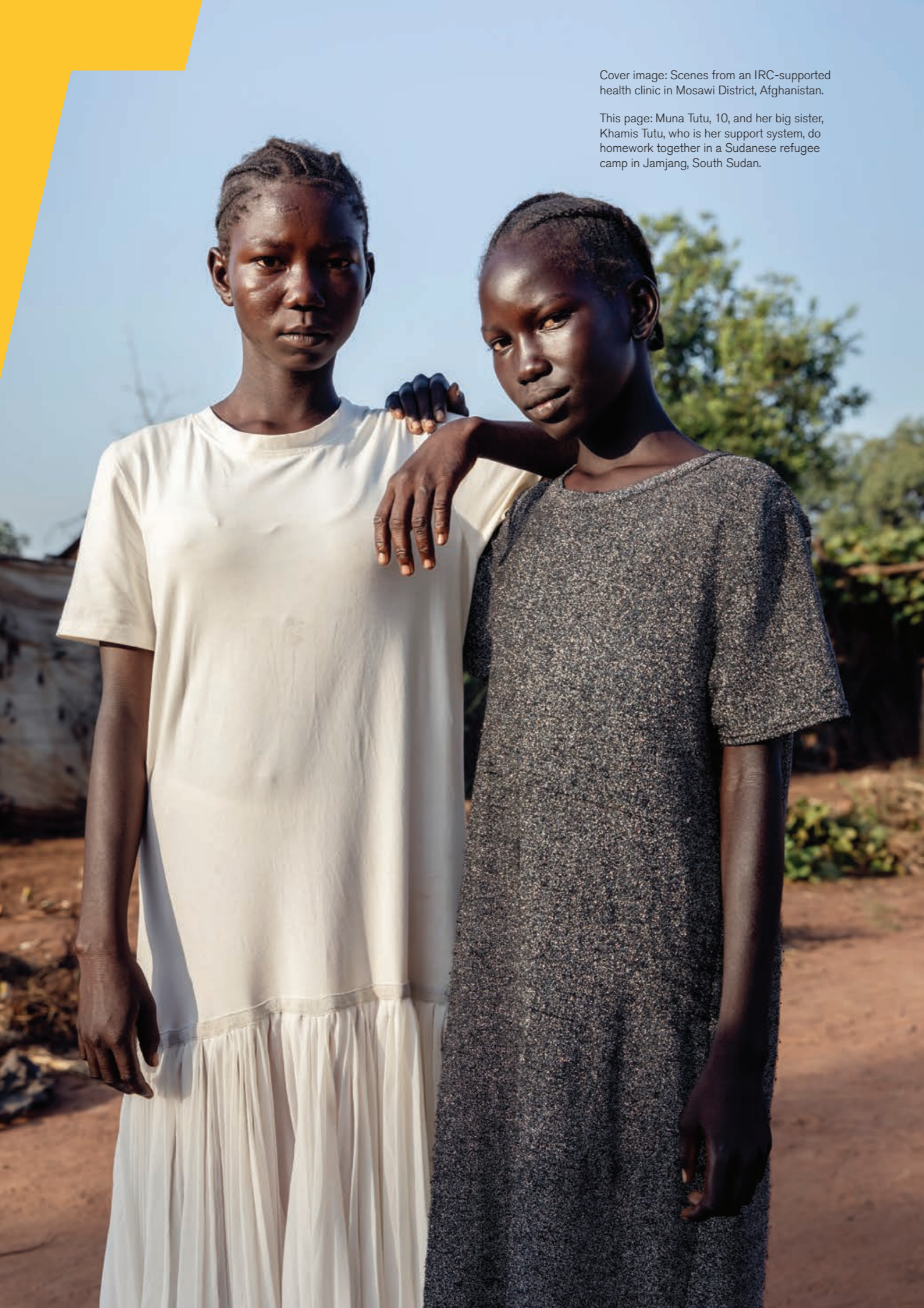
Cover image: Scenes from an IRC-supported health clinic in Mosawi District, Afghanistan.