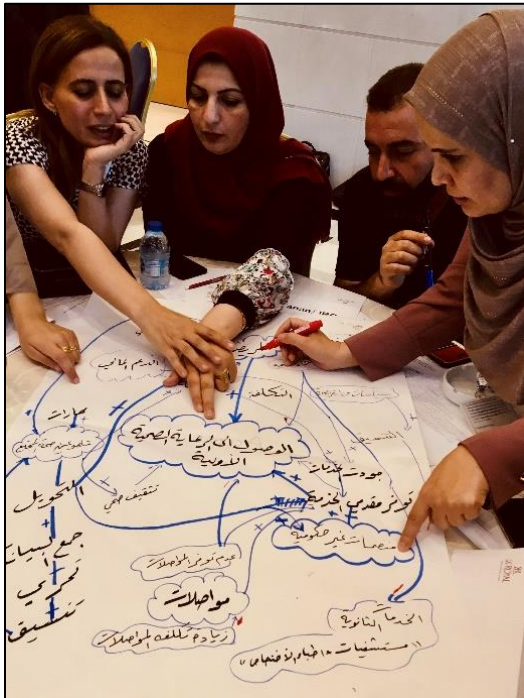
Picture: Co-designing the CHV-NCD program