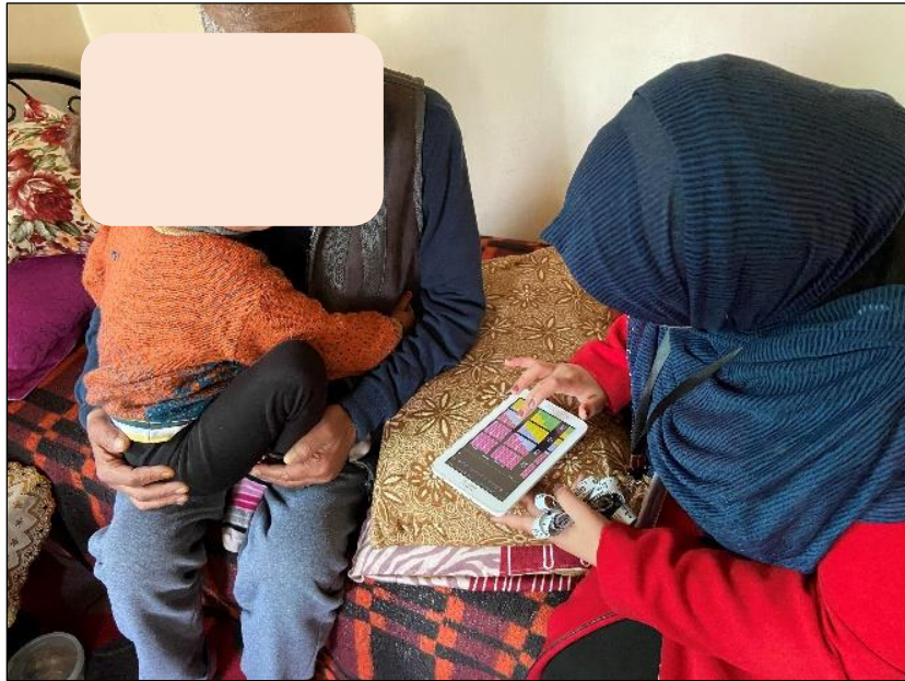
Picture: CHV carrying out an in-person household visit at the start of the study in February 2020, (before the COVID-19 pandemic)