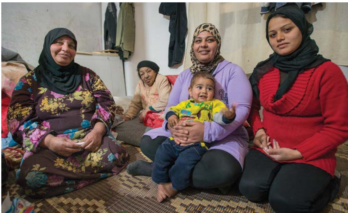
Five generations of the same family from Syria are now living as refugees in Northern Lebanon.

The IRC intends to expand child protection services throughout the region by identifying unaccompanied minors and other at-risk refugee children, assessing their needs, and ensuring that they have access to case management, education and other services. All services will be tailored to local conditions: in Iraq and Turkey, children will have access to safe places to play and learn. In Lebanon, programs will address the special needs of street children. In Lebanon and Jordan, efforts will be made to find foster families to care for unaccompanied children in refugee camps.