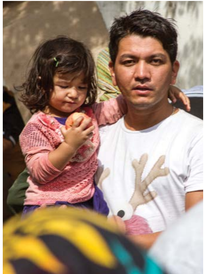
A father and child after landing on the beach in Lesbos, Greece.

Yet, as the number of refugees has surged, it has also become harder for them to travel to Europe legally. European countries have restricted visas once available to refugees,