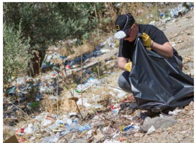
TOP: To alleviate the crowding on Lesbos, the IRC helped arrange for buses to transport refugees to the north of the island where they can take a ferry to the mainland. ABOVE LEFT: Water points at Kara Tepe camp are often filled with trash and surrounded by dirty pooling water. ABOVE RIGHT: An IRC aid worker collects trash at Kara Tepe camp.

Only half of the families at Kara Tepe have any shelter. Women and girls have no private or safe spaces. Relief workers attempt to identify vulnerable people, such as victims of human trafficking, but conditions are so cramped and chaotic that it is extremely difficult to do so. There is only one other camp (run solely by volunteers) available for vulnerable refugees, like unaccompanied children, and water and sanitation conditions there are deficient.