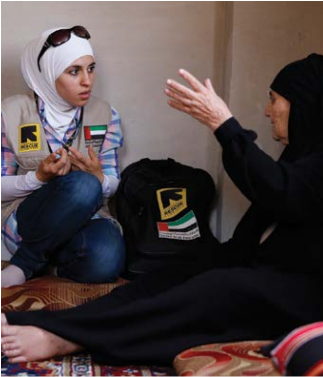
LEFT: An IRC community health volunteer speaks to a Syrian refugee living in Jordan about the IRC's health services. RIGHT: Syrian refugee children at an IRC education center in Lebanon.