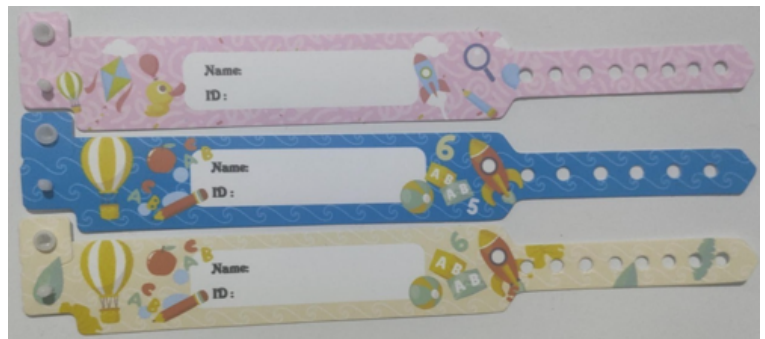
Child Identity Bracelets to note basic identity and family information (e.g. child's name, date of birth, parent's name, address).

The UASC TWG has been actively engaged to scale up interventions to prevent family separation, such as dissemination of key messages to prevent family separation and distribution of child identity bracelets, procured by UNICEF. As of May 15, 105,000 child identity bracelets were distributed by CP actors in informal settlements in Rafah to help mitigate the risk of family separation. With the incursions of Rafah since May 6 and the associated lootings of warehouses, however, it is estimated that about 345,000 child identity bracelets were lost.