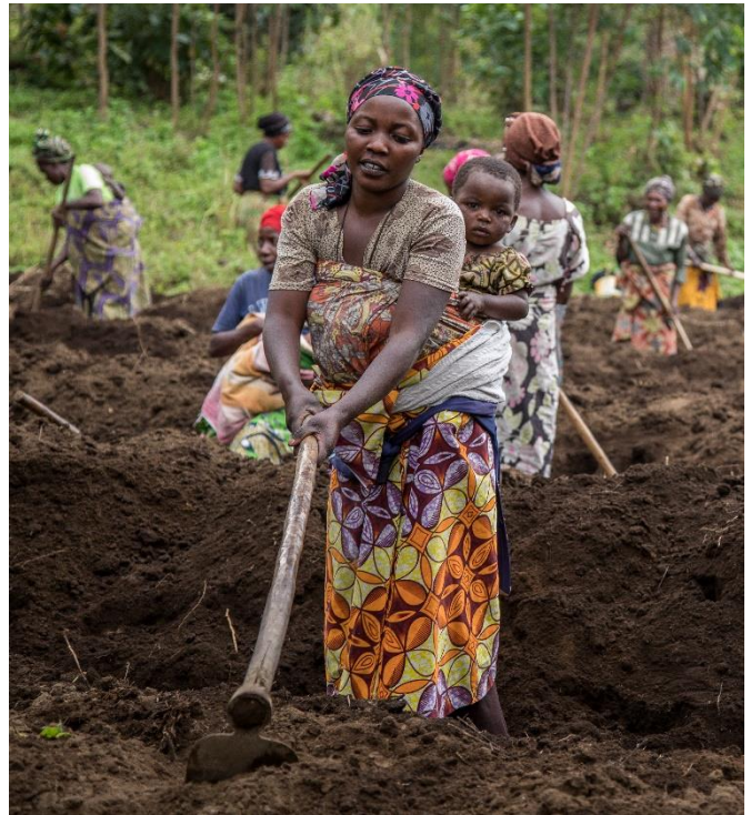
Above: In DRC, members of the IRC-supported community-based organization Tupendane cultivate the land in 2018 following insecurity caused by conflict between DRC armed forces and the M23 rebels.

The FCV lens would also be improved by including an additional policy commitment to strengthen national systems delivery in FCV countries that would support the continuity of vital services, including through operationalizing partnerships with NGOs in a direct delivery, hybrid (joint delivery) or advisory capacity.