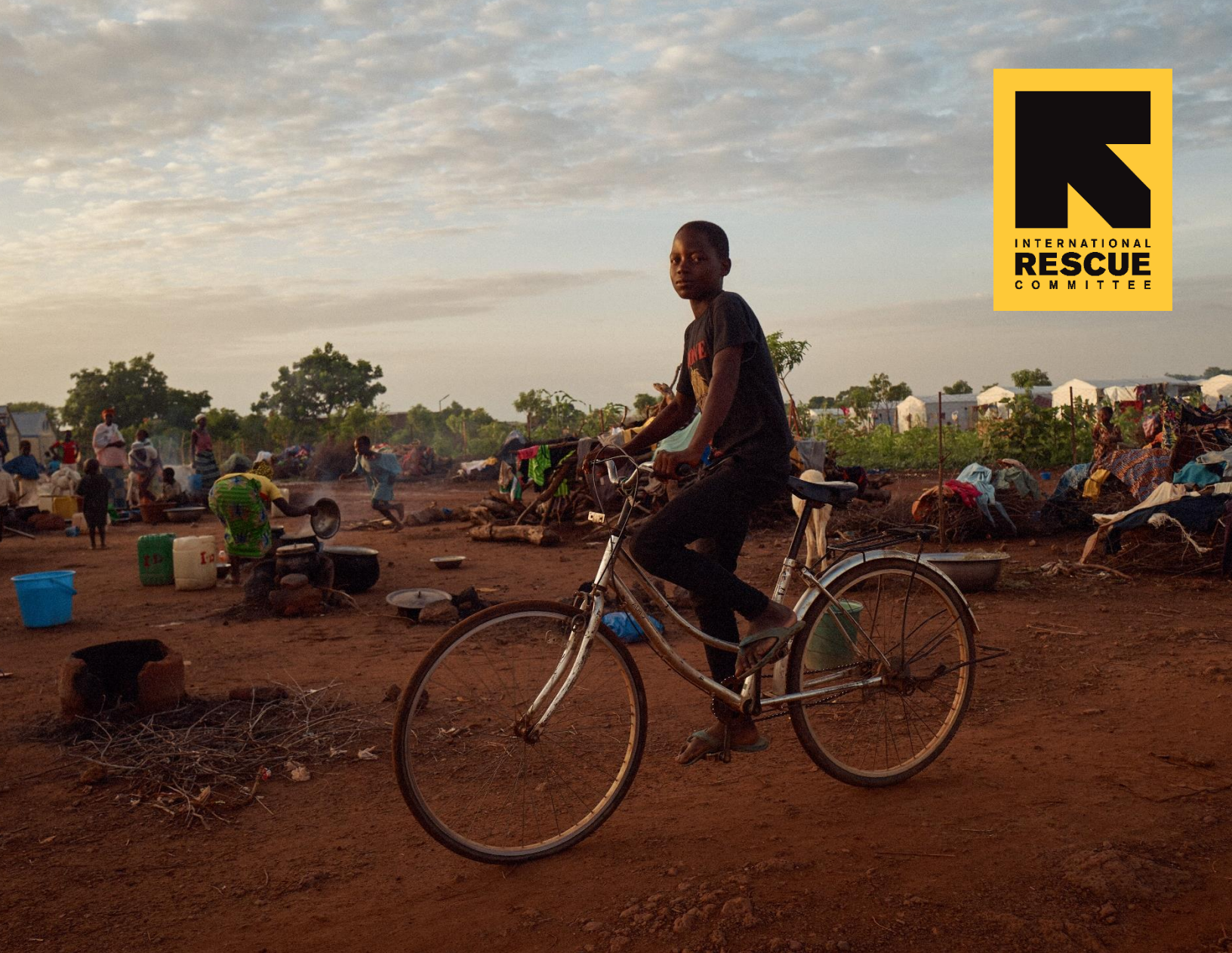
Above: Burkina Faso. A boy rides his bicycle in Tiwega 1, an IDP camp in Kaya, in the Centre-Nord region of Burkina Faso, which hosts 2240 displaced persons who fled insecurity in northern cities of Dablo and Foubè, near the Sahel region.