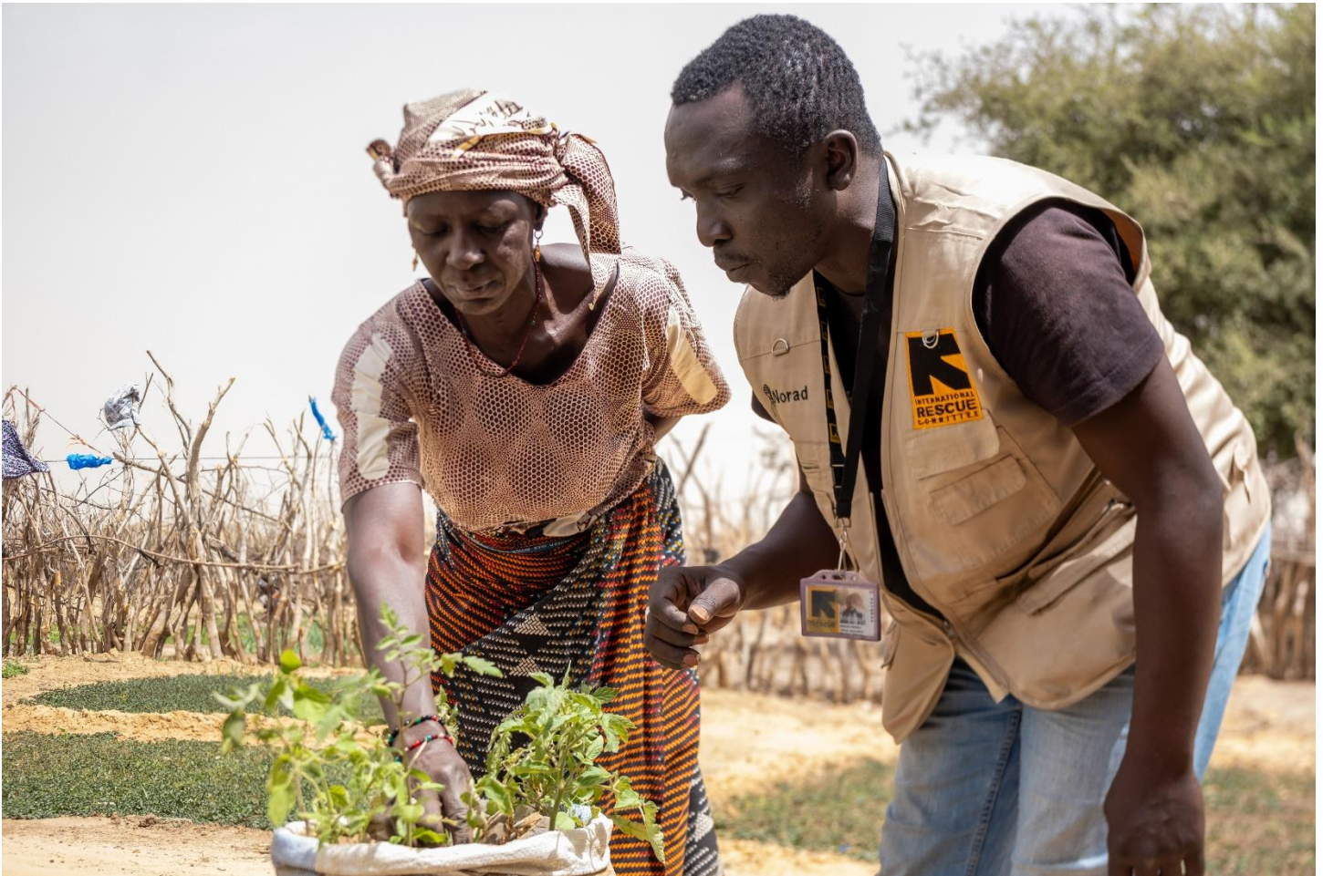
Above: Integrated, Adaptive and Climate-smart Response to Food Insecurity & Malnutrition in 5 communes of Nara, Mali.

The IDA21 replenishment is a critical moment for Bank leadership and stakeholders to secure investment and operationalize the financing and operating model reforms to ensure that IDA delivers for communities in the new geography of extreme poverty. This requires ambitious donor contributions, agreement on an FCV-inclusive policy framework and operationalizing the expansion of partnerships with NGOs and CSOs to maximize IDA impacts in conflict-affected LDCs. These are fundamental steps that recognize IDA's centrality in accomplishing the new World Bank mission to end extreme poverty on a livable planet and enable the Bank to better reach marginalized groups affected by crises with impactful interventions at scale.