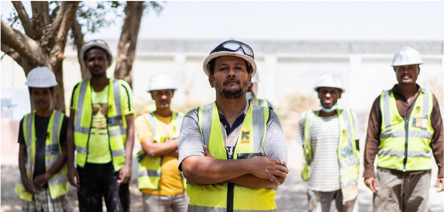
Above: In Yemen, labor team members pose after a day of work for IRC Cash for Work project in a rehabilitated school in Abyan, part of a project that reached 8,514 people, and provided multipurpose cash assistance.