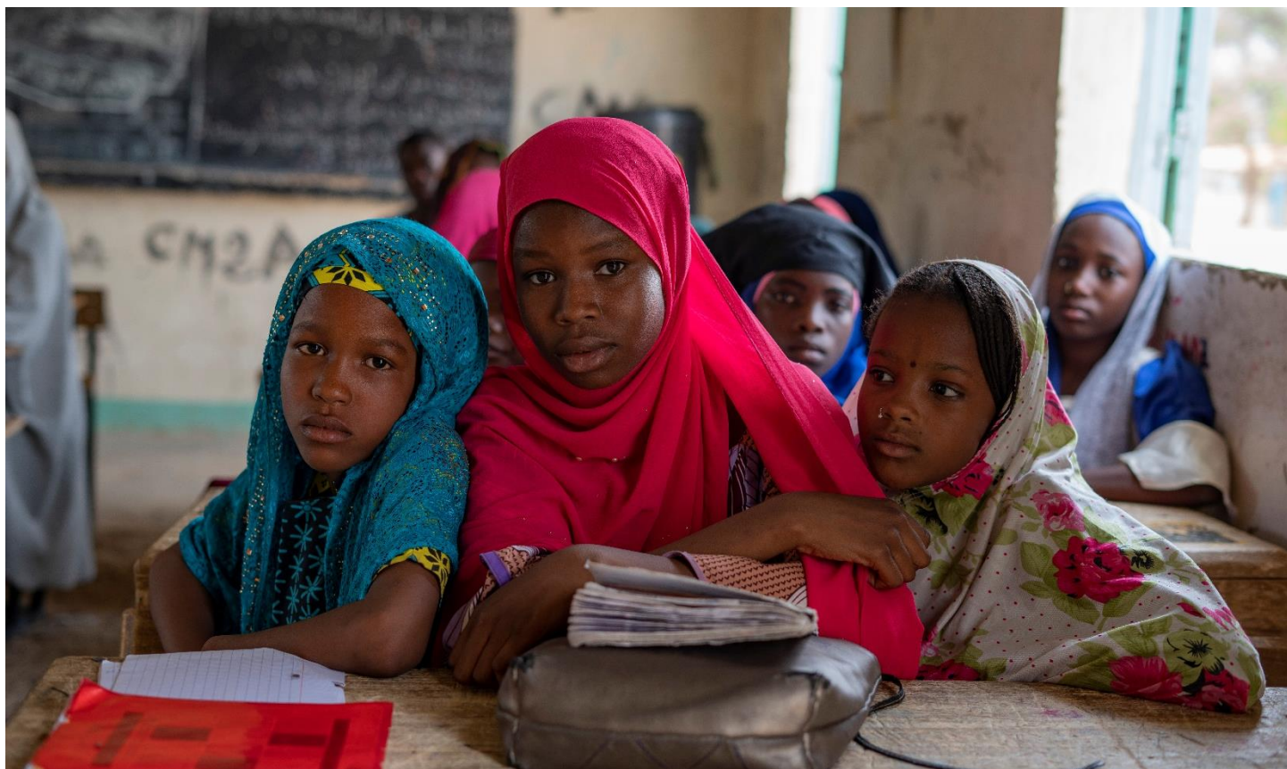
Above: Students at an IRC Tutoring Programme in Niger which offers 3000 low-capacity students (selected in collaboration with school headmasters and teachers) tutoring classes two times a week.