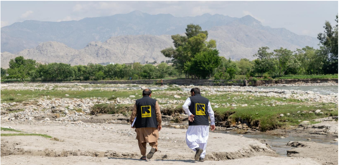
Above: In Afghanistan, IRC staff in walk towards flood-damaged areas in Laghman province.