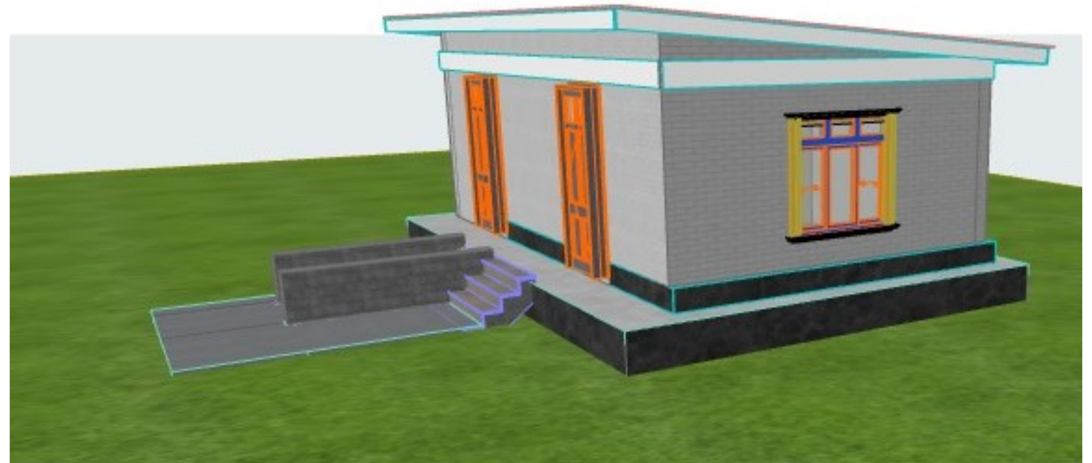
Generic Perspective (7)