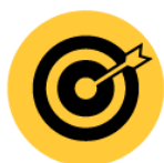
Figure 2: Commitments to Ensure Impact

In order to maximize impact and achieve the priority outcomes, the IRC in Burundi is making new investments to improve program effectiveness, use resources more efficiently, reach more people, and react more quickly when crisis strikes. The IRC made the following commitments to strengthen programming and improve the lives of the people it serves in Burundi.