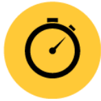
Figure 2: Commitments to Ensure Impact

In order to maximize impact and achieve the priority outcomes, the IRC in Kenya is making new investments to improve program effectiveness, react more quickly when crisis strikes, be more responsive to beneficiaries and partners, and incorporate cash programming.. The IRC made the following commitments for 2019 to strengthen programming and improve the lives of the people it serves in Kenya.