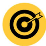
Figure 2: Commitments to Ensure Impact

In order to maximize impact and achieve the priority outcomes, the IRC in Côte d'Ivoire is making investments to improve program effectiveness, use resources more efficiently, reach more people in more places, be more responsive to beneficiaries and partners, and react more quickly when crisis strikes. The IRC made the following commitments to strengthen programming and improve the lives of the people it serves in Côte d'Ivoire.