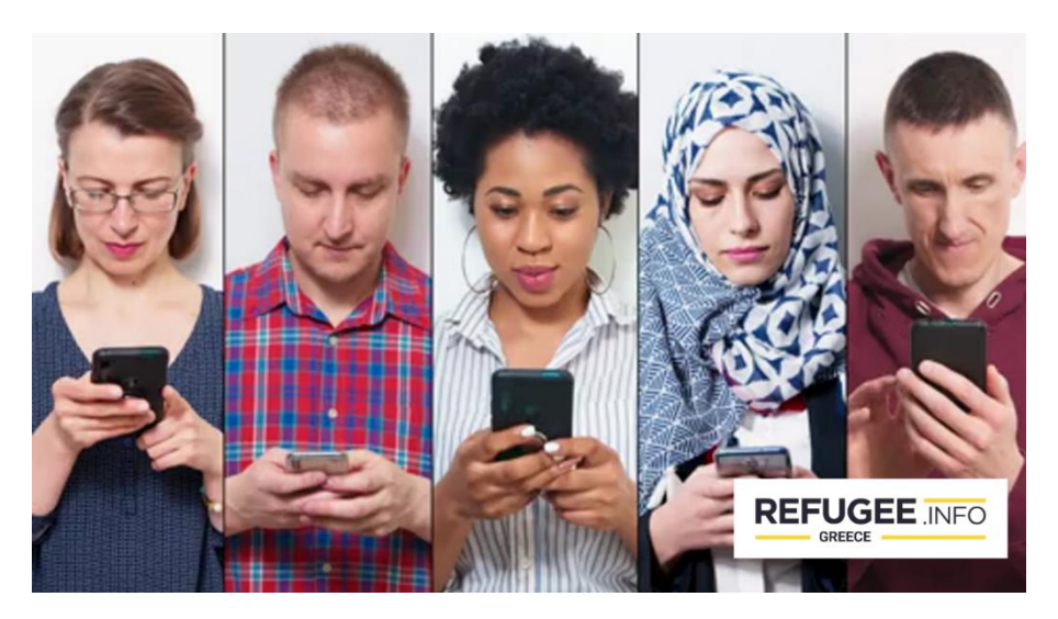
Part of the communication material created under the Refugee.Info.

Throughout 2023, Refugee.Info has been following news and developments to keep its website and social media content up to date, in order to capture changes in asylum procedures, bureaucratic policies or practices, and administrative changes while it shared information in six languages (Arabic, Farsi, French, Urdu, Ukrainian and English). In September 2023, the Somali language was added to its roster ensuring that all content on the website and social media is available in Somali while also Somali users can reach out to the helplines of Refugee.Info to ask a question in their mother tongue. Additionally, in November 2023 Refugee.Info Greece launched seven (7) Telegram announcement channels (one for each language it supports) and currently 567 people have subscribed to these channels.