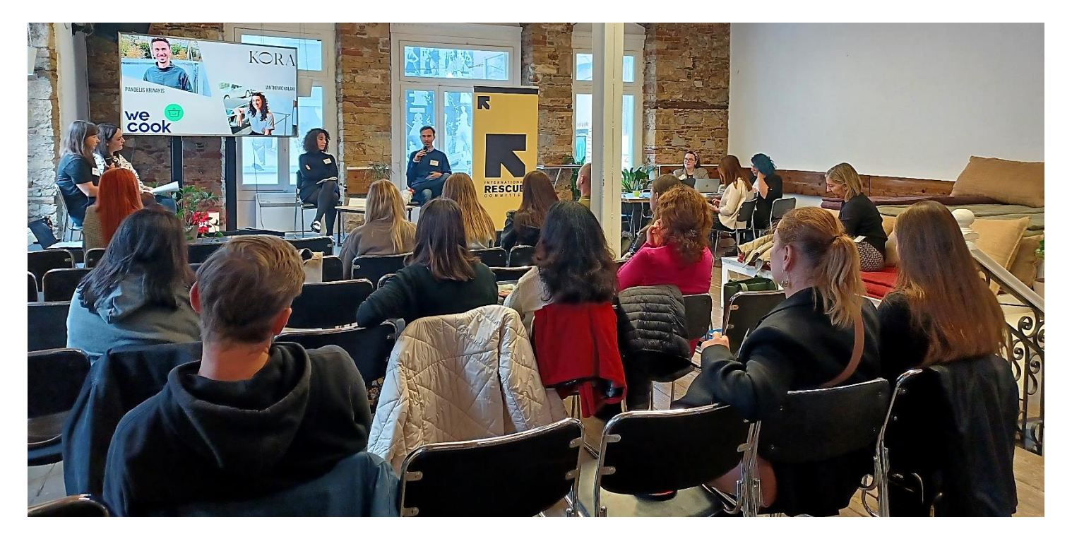
IRC Hellas ERD Networking Event at Impact Hub Athens in November 2023, featuring our guests from Kora Bakery and Wecook.