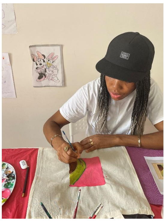
RIGHT and LEFT: IRC clients participating in psychoeducation sessions conducted in Lesvos.

In Northern Greece, in Thessaloniki, from February 2023, IRC through the partnership with the Irida Women's Center supported in total 235 women . 47 women received individual counseling sessions and 141 women participated in psychosocial support activities. In addition, 125 women received legal support . Finally, 161 children participated in the child-friendly space activities.