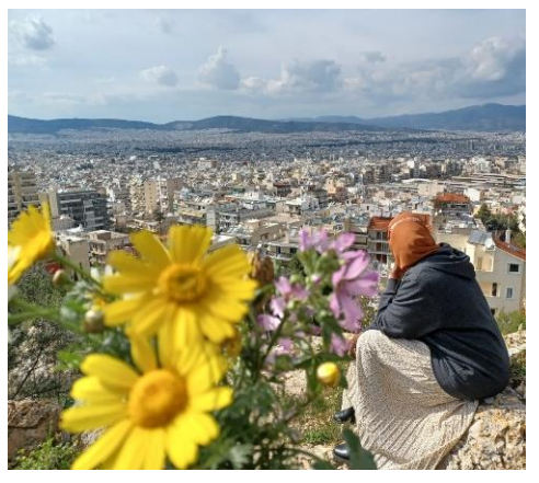
LEFT: A group of unaccompanied asylum-seeking adolescent boys, supported by the SIL framework, on a trip to Athens's south suburbs in December 2023. RIGHT: An unaccompanied adolescent girl, supported by the SIL model, on a morning walk in the area of Kypseli, in May 2023.

At the same time, we support activities that promote the adolescents' interaction and integration into the Greek society, such as visits to cultural events, museums and participation in sports activities, while the children are enrolled in local high schools. The social workers are in regular communication with the teachers and headmasters of the schools and are kept informed of the children's progress and their adaptation to the school environment.