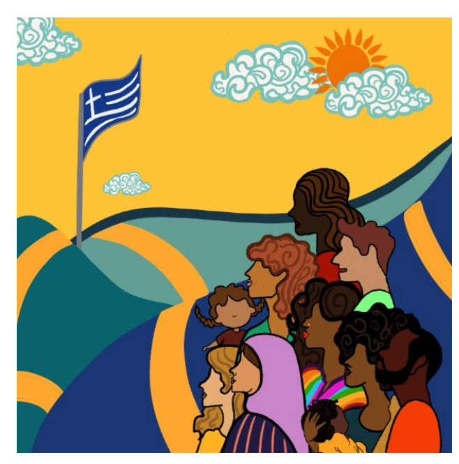
Illustration supporting our Advocacy work commissioned by Sahar Ghorishi/IRC.

The advocacy team also organizes meetings and events to bring policy makers together and push for the full respect of asylum seekers and refugees' rights. In 2023, four (4) events were coorganized by the IRC and other NGOs, and fourteen meetings with stakeholders from the Greek government and EU institutions were held to raise various issues refugees and asylum seekers face in Greece. In addition, the IRC, often in joint initiatives, sent six (6) letters, drafted two (2) advocacy briefings and published nine (9) press releases.