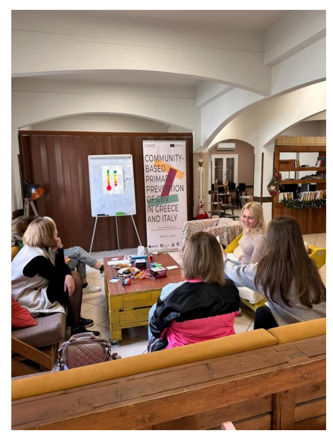
Female participants attending the Women Rise psychosocial support groups in the framework of CARE project in October 2023.

In 2023, IRC continued to provide MHPSS services to the hosted community but also to the asylum seekers and the refugees residing in the Closed Controlled Access Center (CCAC) on Lesvos island. In Athens, IRC continued the cooperation with the organization One Happy Family in the "Victoria Community